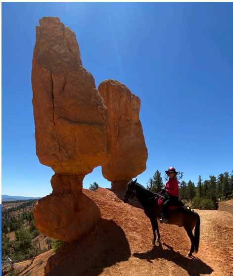
Bryce Canyon area