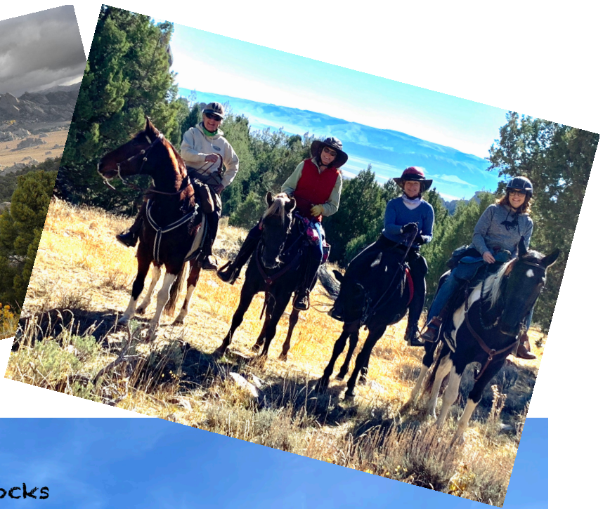
City of Rocks